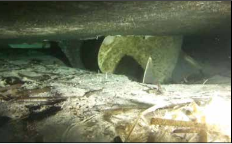
Figure 4: Isamar 's port propeller and bracket penetrating hull