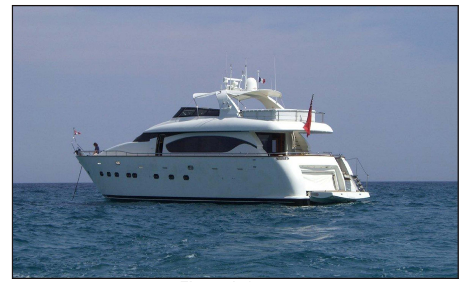
Figure 1: Isamar

On the afternoon of 17 August 2013 the 24m, 62gt, privately owned motor yacht Isamar struck the Grand écueil d'Olmeto shoal while on passage from Bonifacio, Corsica to Roccapina bay. The three crew were unable to halt the flooding, but were able to abandon the vessel with the eight passengers before Isamar foundered in 55m of water.