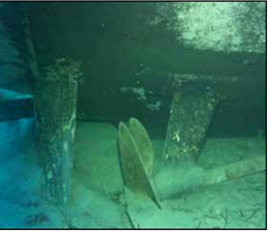
Figure 3: Isamar 's starboard propeller and bracket (intact)

A subsequent dive inspection of the wreck showed that Isamar 's starboard propeller was intact (Figure 3) and that her port propeller and support bracket had been driven through the glass reinforced plastic hull (Figure 4) when the vessel struck the shallow reef.