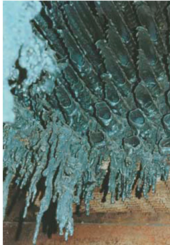
Fig. 15: Development of a soot fire in an exhaust gas boiler