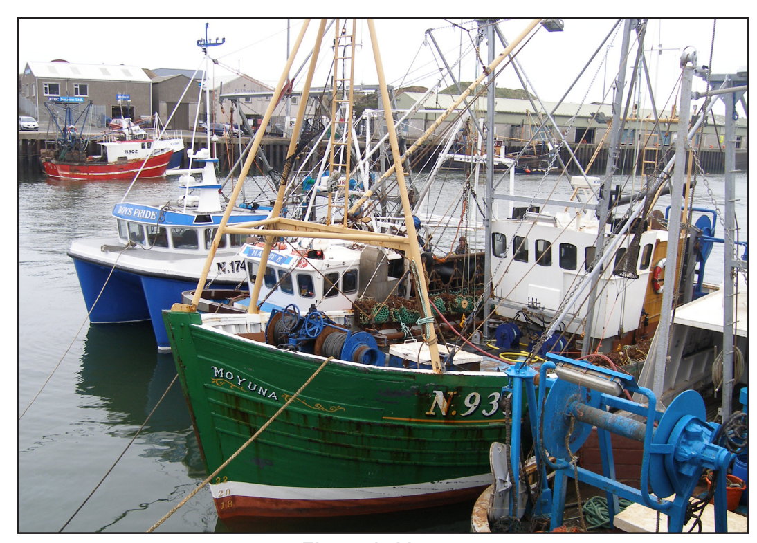
Figure 1: Moyuna

A recommendation has been made to Moyuna 's owner designed to improve navigational practices on board the vessel. The harbour authority has also been recommended to complete its intended review of navigational aids to to ensure they are effective, reliable and well publicised to users of the harbour.