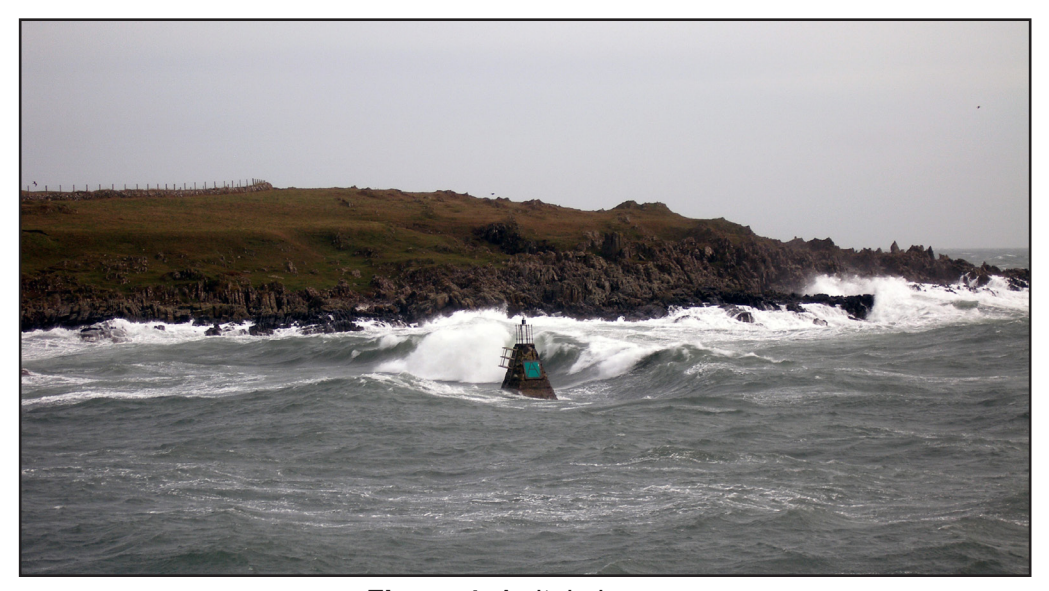
Figure 4: Ardtole beacon

was not formally recorded by the Commissioners of Irish Lights as having a light until 2008. The light was reported as 'washed away' on 5 October 2010 and reinstated on 11 February 2011. Given the intermittent operation of the light. the harbourmaster routinely checked the harbour navigation lights every evening.