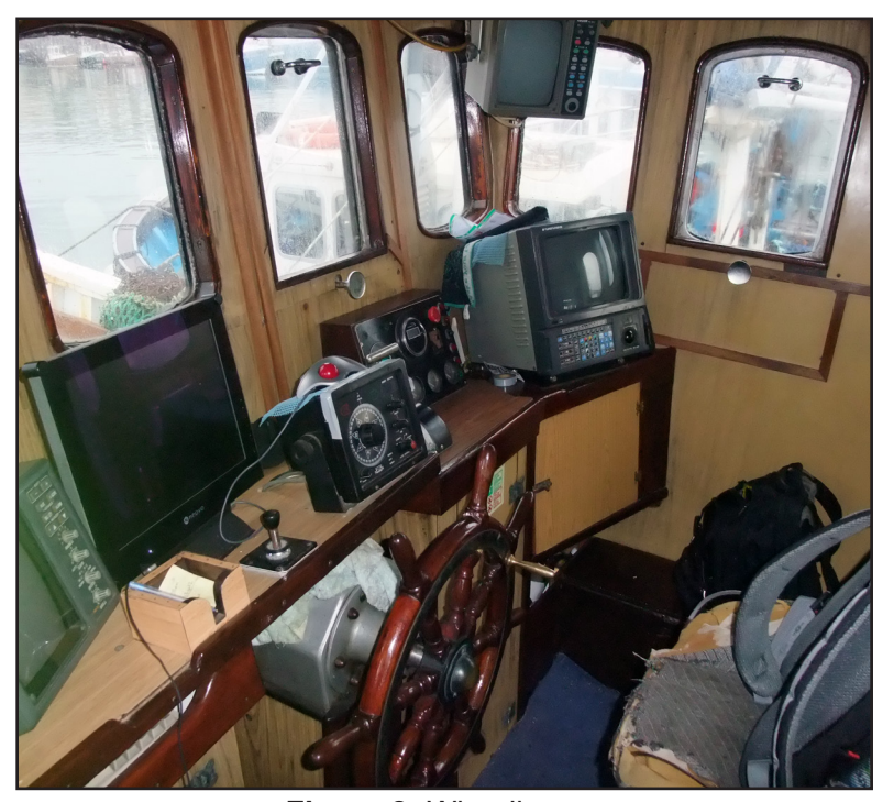
Figure 2: Wheelhouse

At the time of the accident, there was a north-westerly force 2-3 breeze off the land, with slight sea conditions and good visibility. Low water was at 0155 on 22 November 2011.