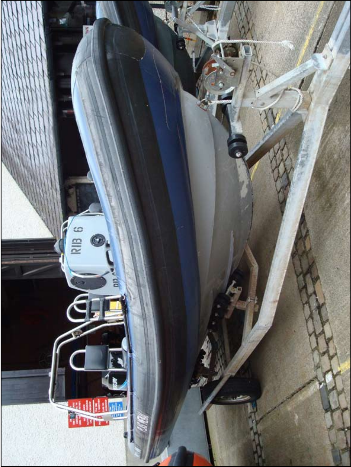
Plas Menai Rib 6