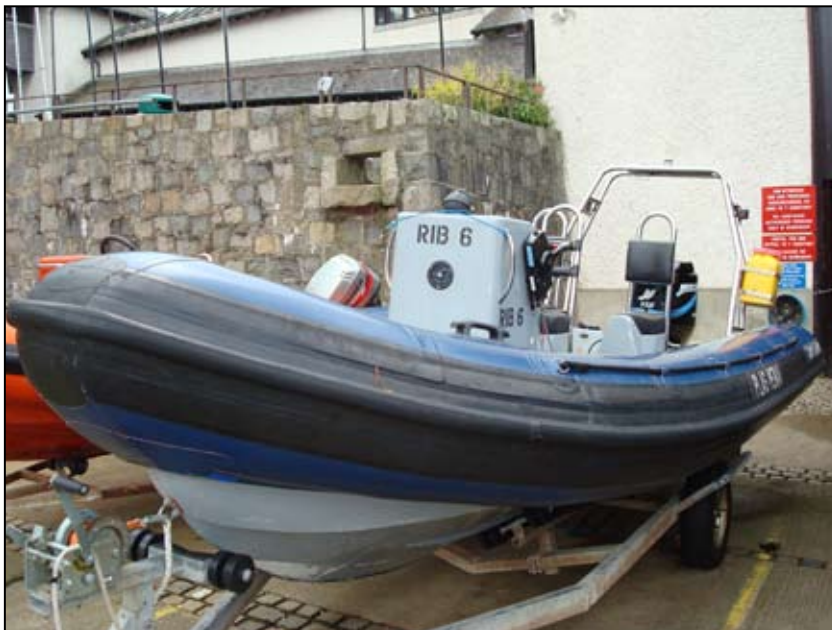
RIB 6 seen from bow