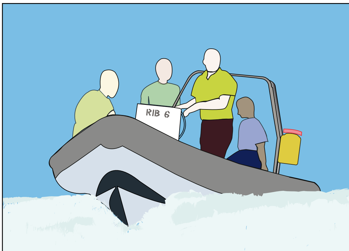
Illustration showing RIB 6 with driver standing at side of console

During this period, the AI noticed that her fuel gauge was low, making her a little concerned about her RIB's endurance now that the activity had been extended. She therefore turned RIB 6 into smoother water to refuel, rejoining the other two RIBs about 10 minutes later.