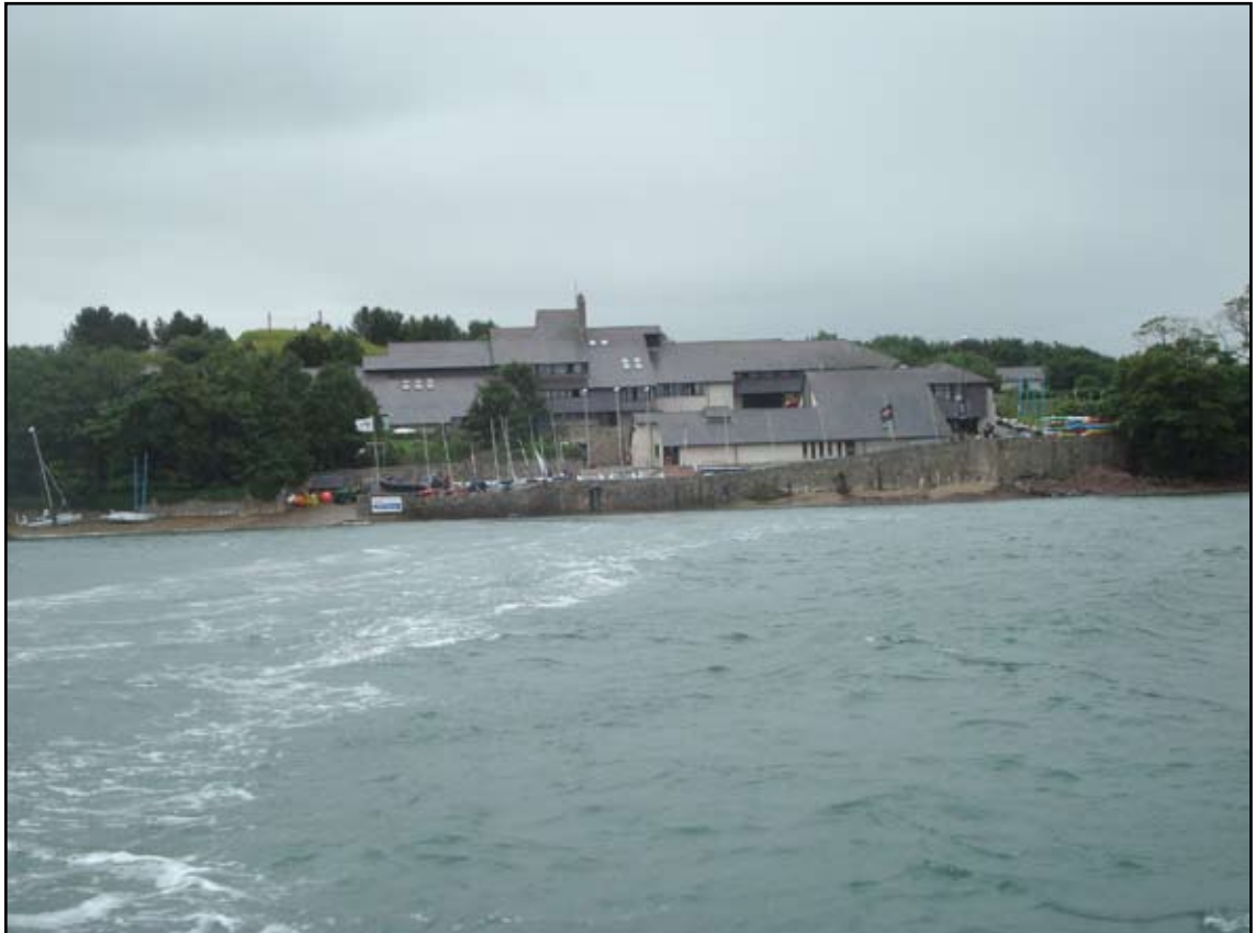
Plas Menai Centre

Established 25 years ago, Plas Menai is a purpose-built centre, owned and operated by the Sports Council for Wales. It includes residential accommodation, together with very extensive watersports facilities. The centre conducts a wide variety of activities and training including sailing, canoeing, windsurfing and powerboating.