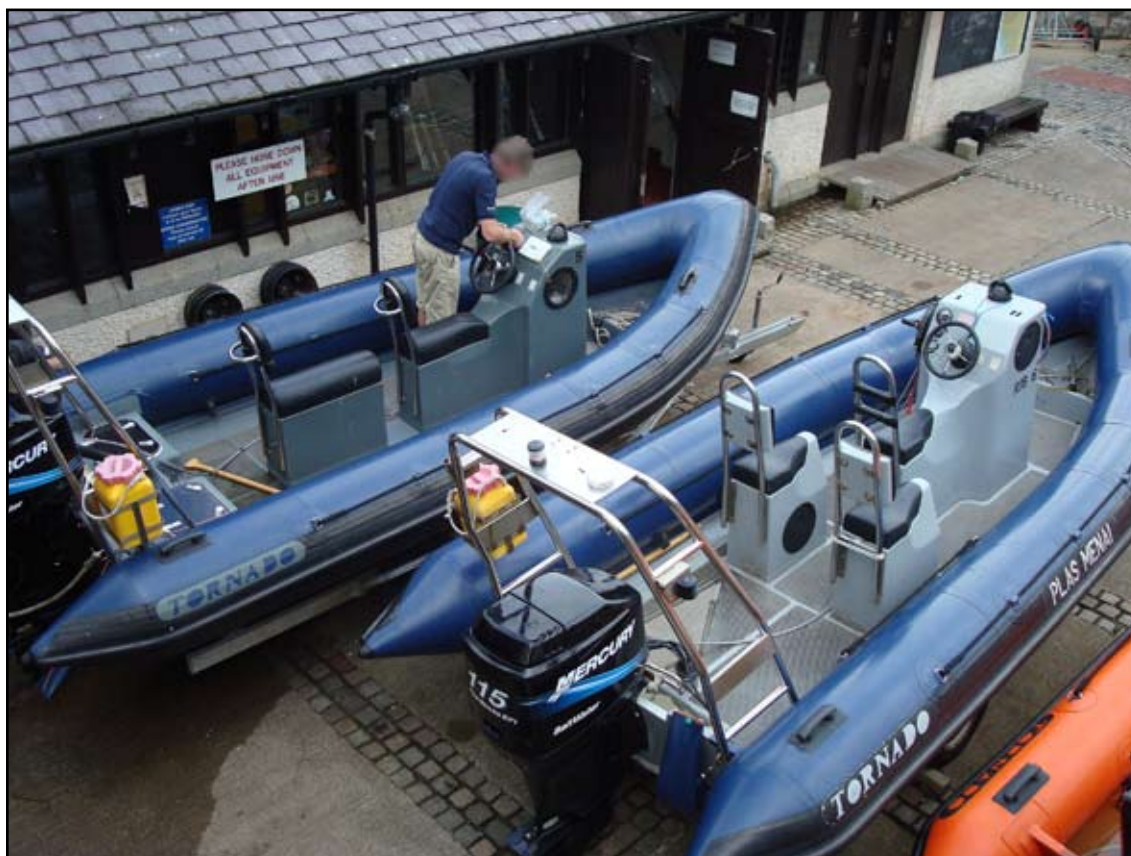
RIB 5 and RIB 6

At about 1700 the JliC arrived at the centre and all three instructors met to check and prepare their boats and equipment. They launched two RIBs, the third was already on the water, and the AI collected a spare can of petrol and placed it on board RIB 6 .