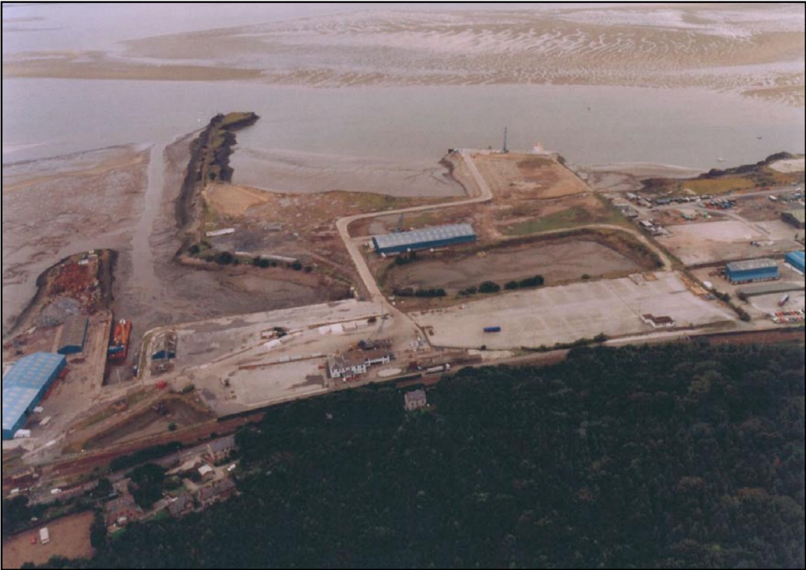
Port of Mostyn during redevelopment C1998