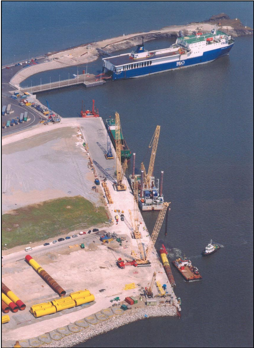
Port of Mostyn post redevelopment