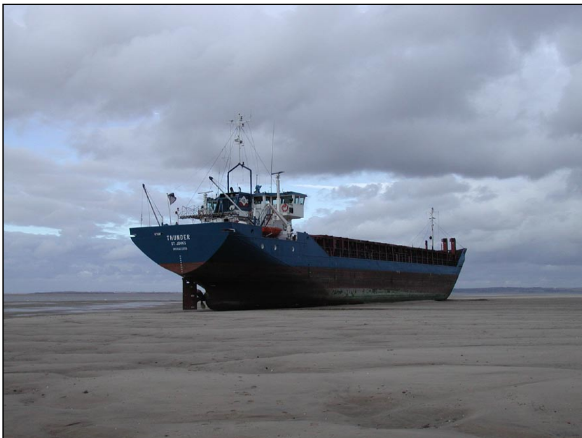
Thunder aground pm 10 August on the Mostyn Bank