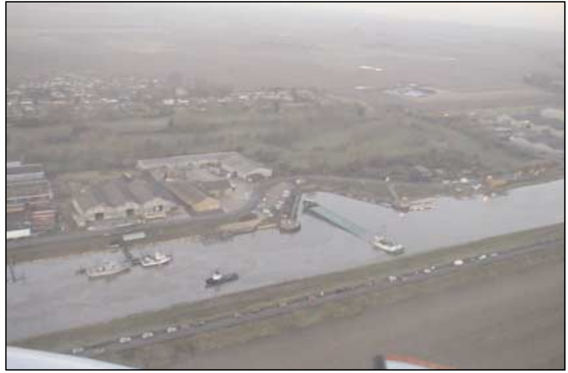
Aerial view from the east (note some pollution)