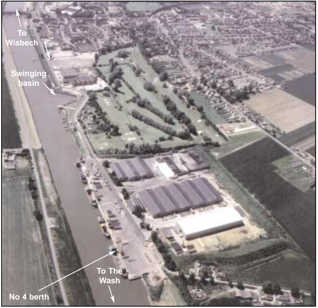
Port Sutton Bridge looking to the south

Port Sutton Bridge Ltd has terminal regulations and a quality assurance procedure for vessels using Port Sutton Bridge.