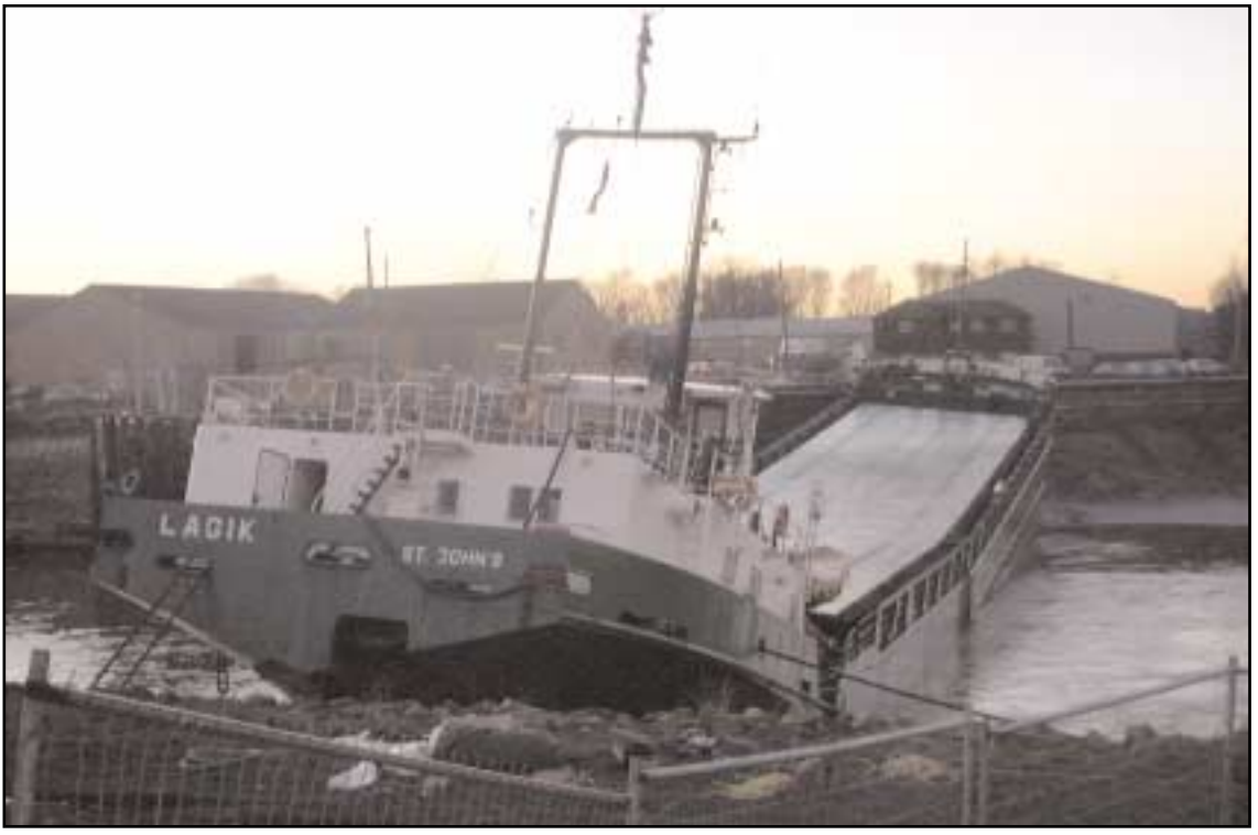
View from the east bank