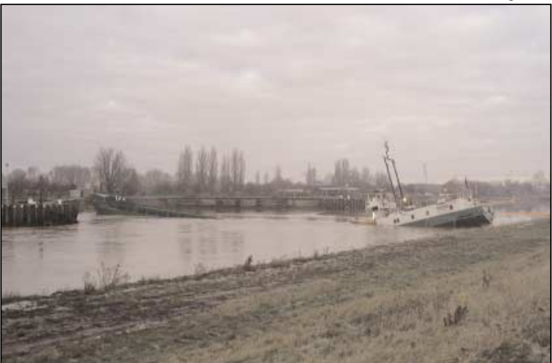
Lagik's aground at high water