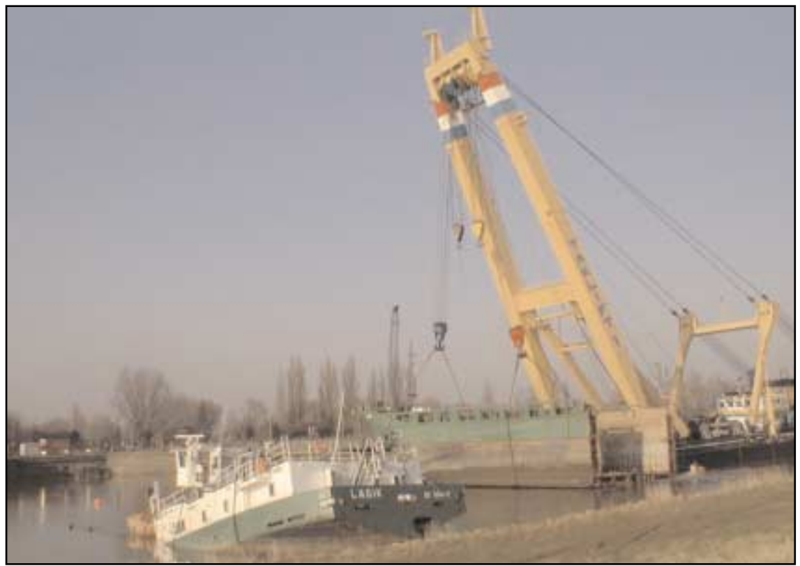
Floating section of Lagik is removed