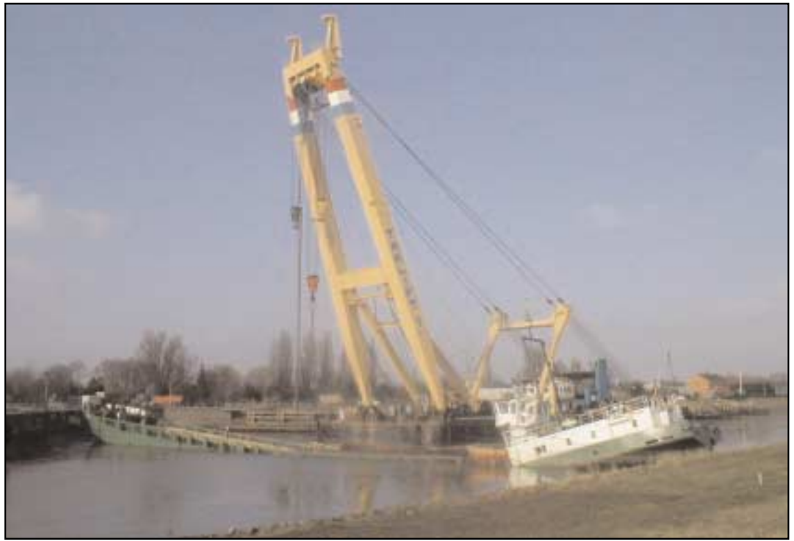
Floating crane moving into position