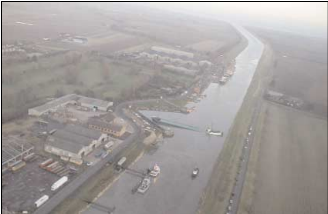
Aerial view from the south