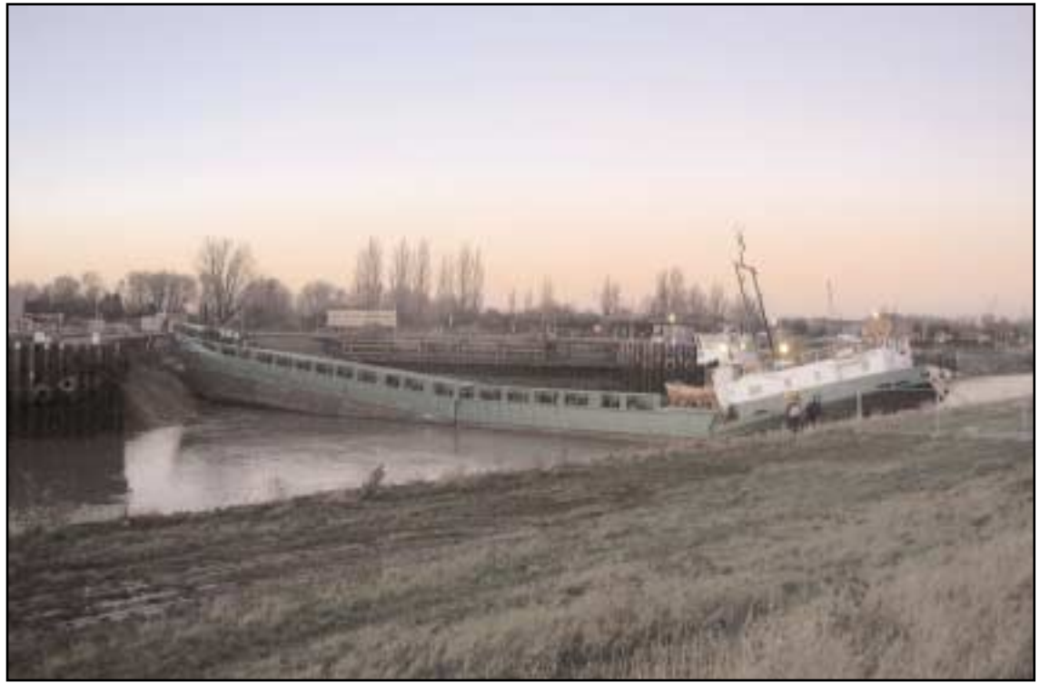
Lagik's aground at low water