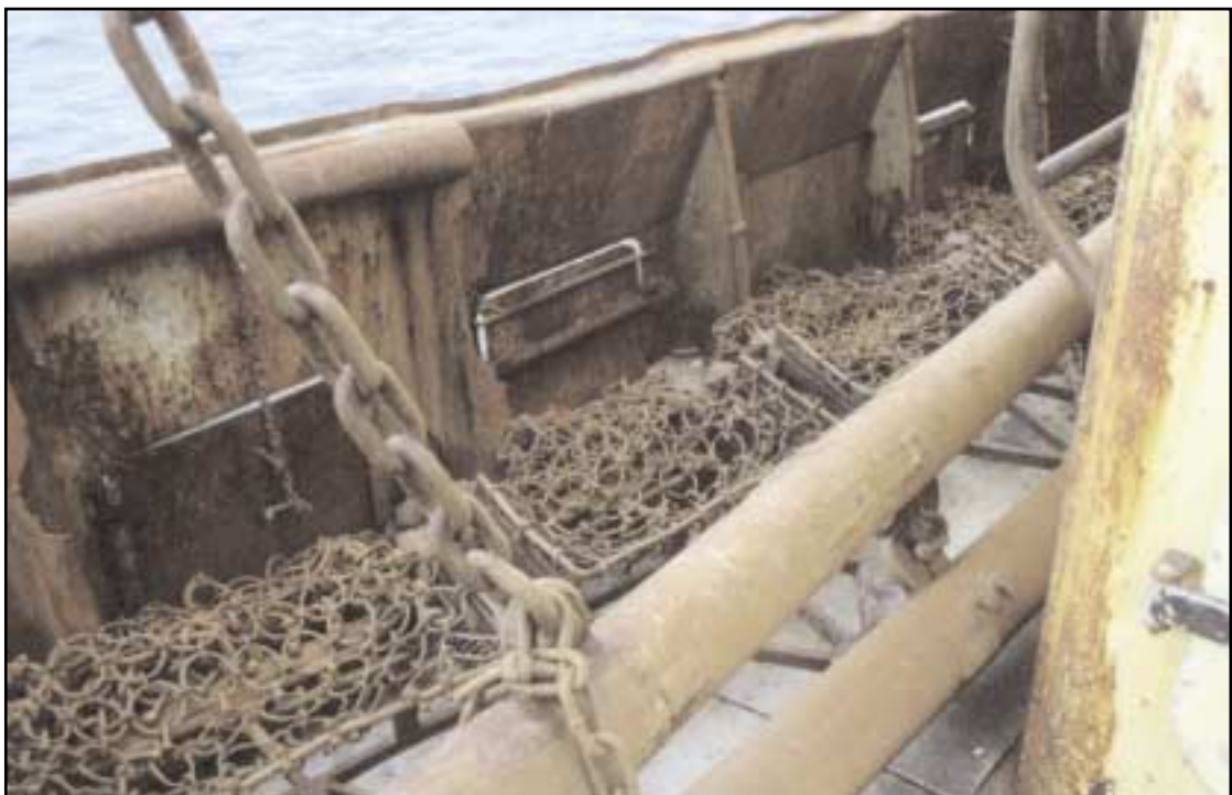
View of scupper doors in position