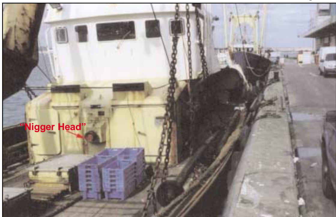
General view of wheelhouse and winch house. Note central position of "Nigger Head" (painted red).