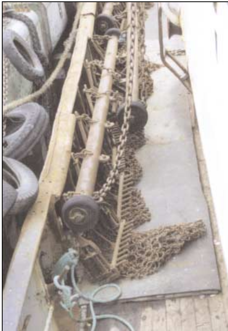
General view of port side, main deck showing dredges and steel deck protection plate